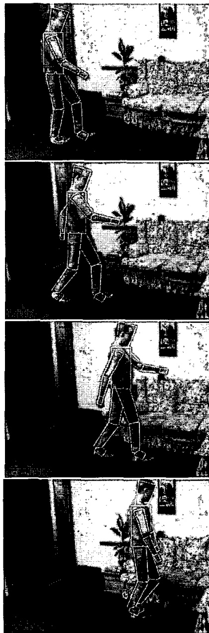
Figure 5. Tracking a walking sequence