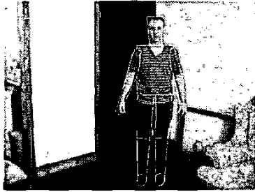
Figure 1. An example frame taken from a waving sequence with the model contour overlaid.

The model presented here uses super-quadratics to represent body parts. The pose vector has twenty-two components: six global transformation parameters and four Euler angles for each limb. The system does not model independent head, hand or foot motion. Currently, the camera is specified using orthographic projection since the scenes contain little perspective effect. The extension to perspective projection is straightforward. Figure 1 provides an example, showing the contour aligned to a frame from a sequence of a waving gesture. Results from processing this sequence are used throughout the report to illustrate ideas.