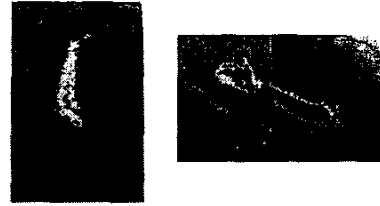
Figure 2. Probability map for a stationary lower arm histogram for images two seconds apart. It can be seen that the distribution changes.

We proceed by associating colour histograms with surface points on the body surface and denote these by H_{n,\bar{\omega}} . To model the likelihood of a hypothesized pose, \bar{\phi}' , we first project the model into the image. The set of visible pixels, denoted by \{V\} , is tagged with the corresponding body part number, n , and co-ordinate, \bar{\omega} . Using this set, hypothesized histograms, H'_{n,\bar{\omega}} , are built. Each of these hypothesized histograms is then compared to the corresponding learned his-